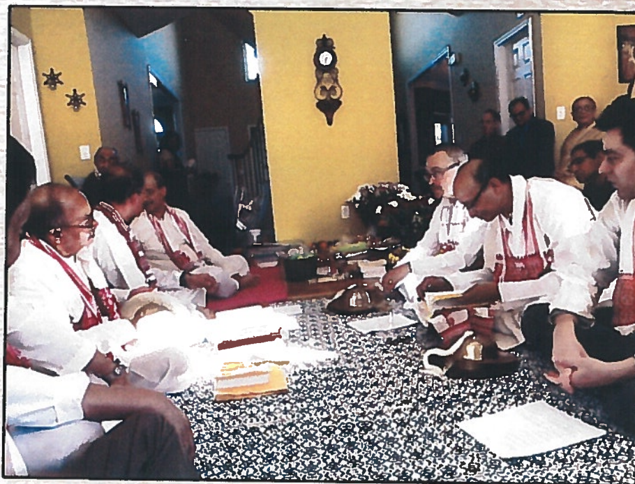
Figure-4: Performing Naam-Praxanga at the Residence of a Host Family