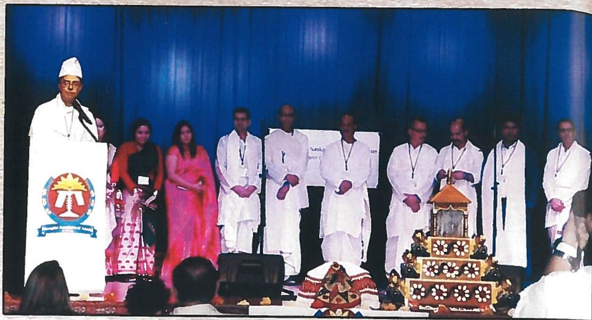
Figure-3: Donation of Guru-Axon by Satradhikar for our Naamghar, ] organized at a cultural function in New Jersey in December, 2017