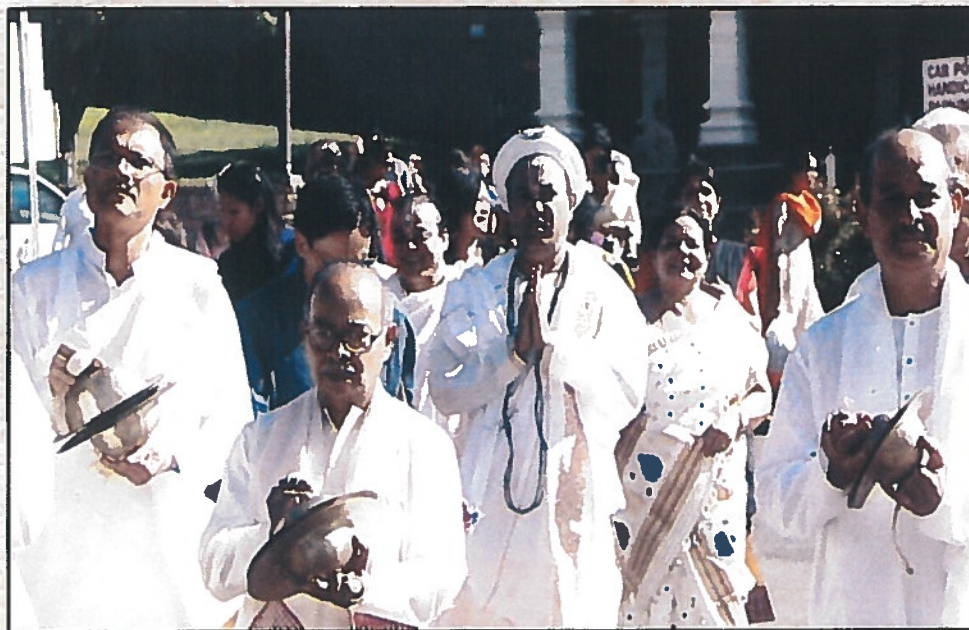
Figure-2: Enthusiastic Bhakats and Bhakatanis are seen with Satradhikar coming for Sankardev Tithi