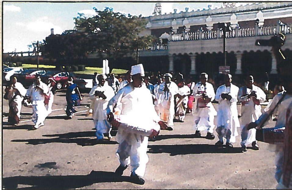
Figure-1 : Traditional Assamese Gayan-Bayan welcome of Satradhikar at Sankardev Tithi, Balaji Temple, Bridgewater, NJ, 2016